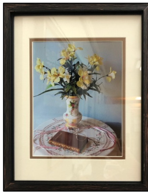
Lisa Brewer "Hood's Poems" photography