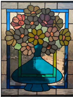
Becky Floyd "Art Deco Vase with Flowers" stained glass