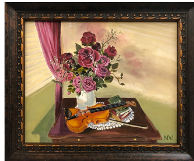
Norma White "Roses and Violin" acrylic