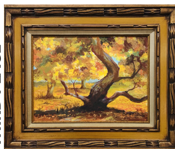
Bill Gorajia, "Autumn 2", Acrylic