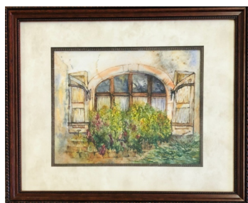
Catherine Crum, "Fall Stroll" Watercolor