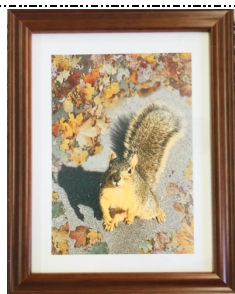
Lori Alarcon, "Please, Can I Have Some More?", Photography