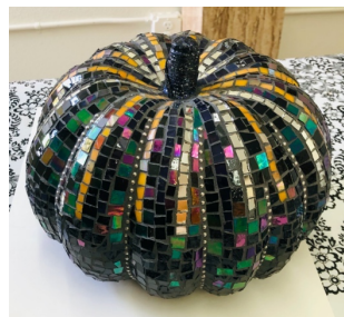
Becky Floyd, "Glam-Shock Pumpkin", Stained Glass Mosaic